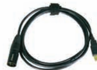
USB SMPTE & DMX Link