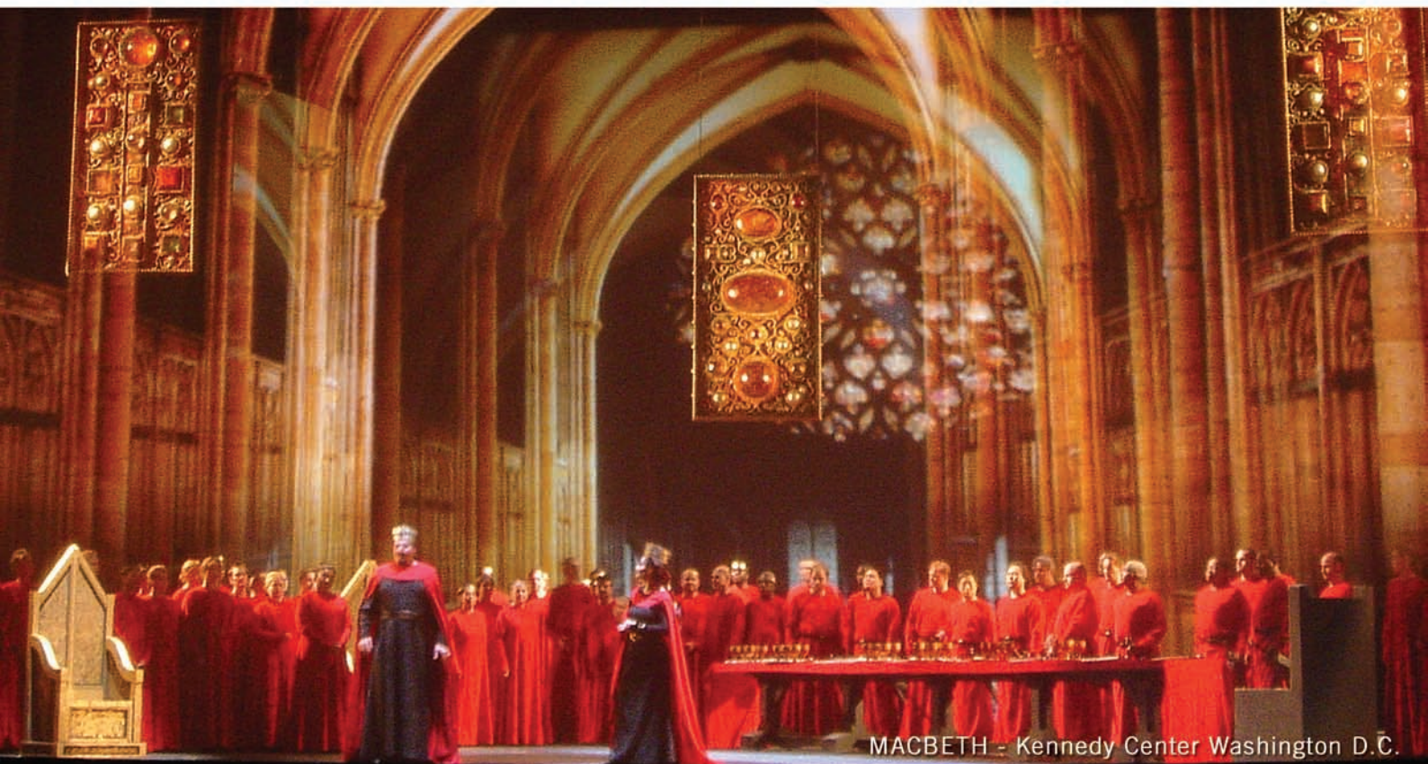
MACBETH - Kennedy Center Washington D.C.