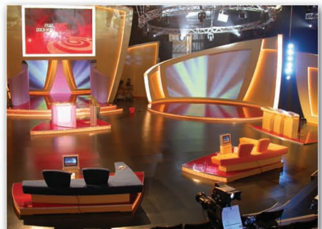
WDR - Digital Set Design Real-Time Media Control